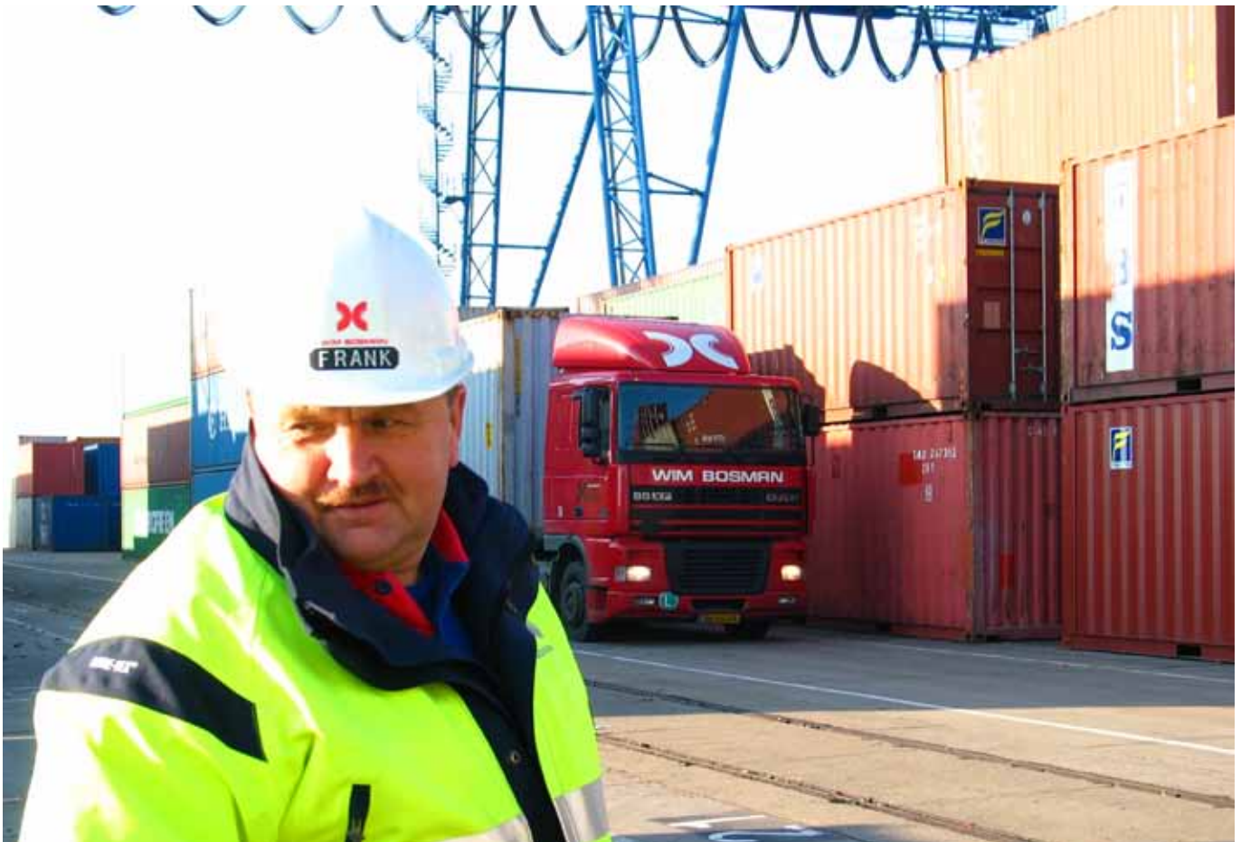
Emmerich Container Operations

WIBO means WIBO C.V.B.A. a co-operative company incorporated under the laws of Belgium.