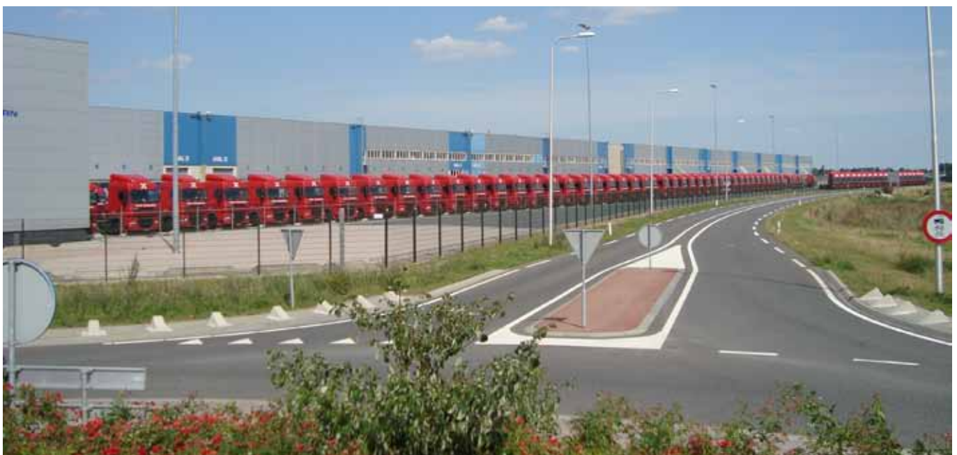
's-Heerenberg Breede Steeg facility

The Wim Bosman Group has 240,000m 2 of storage capacity and a further 6,700m 2 at the group's 's-Heerenberg branch for the storage of hazardous materials. Additional storage capacity is rented when needed.