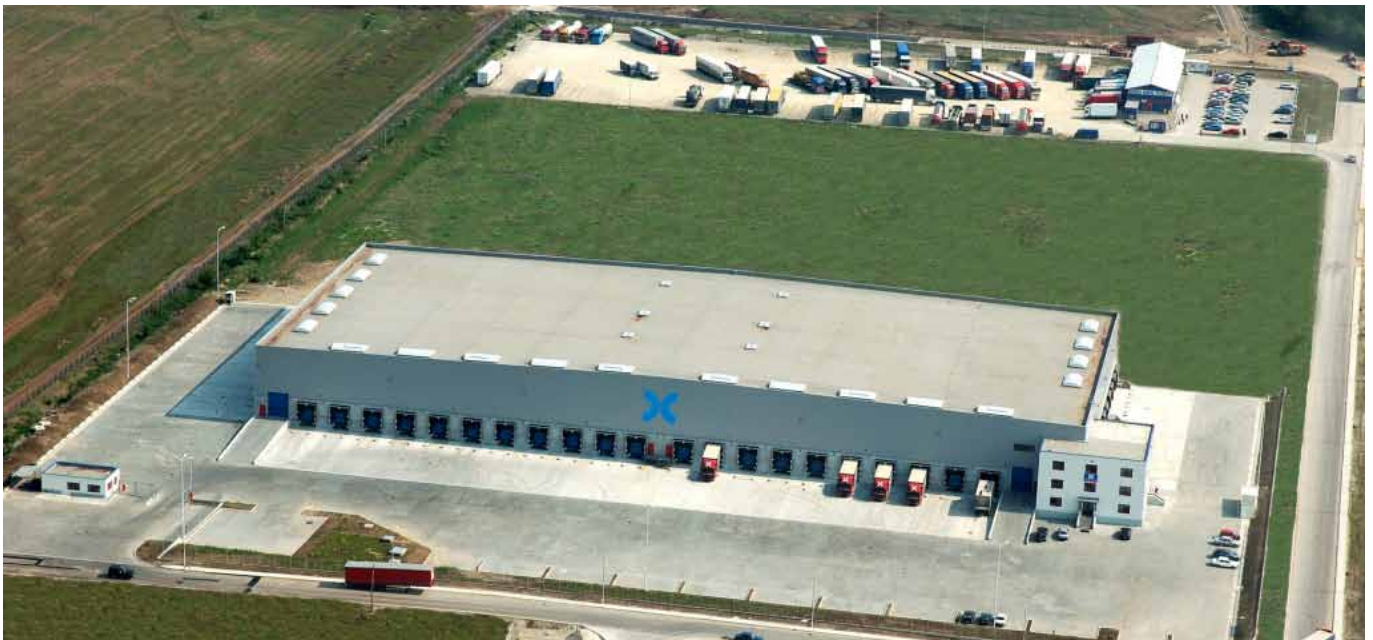
Full warehouse, Romania